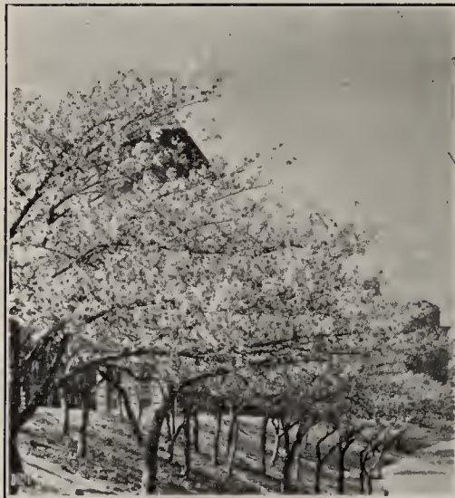
JAPANESE FLOWERING CHERRY

Willow, Weeping. Used especially for planting about streams and in low land. 6-8 ft., $1.50 each, $15.00 per doz., $85.00 per 100; 8-10 ft., $2.00 each, $20.00 per doz., $145.00 per 100.